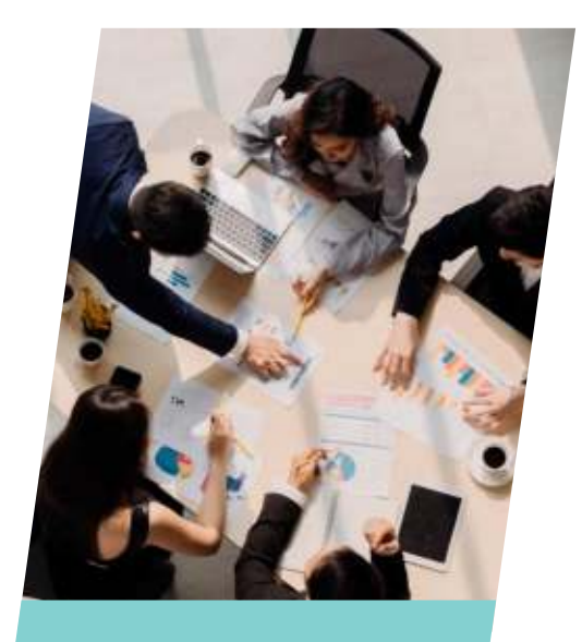
Week 5 Onwards