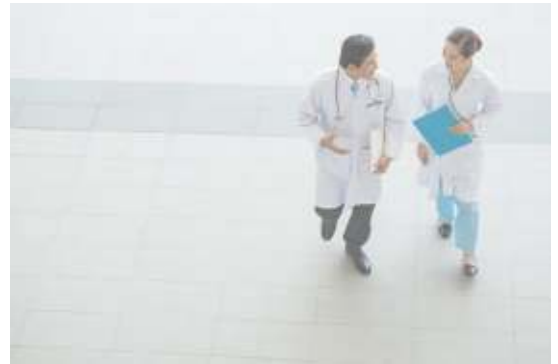
Table 1. SKIN CARE PROFESSIONALS

This report section shows a close-up look at the performance of the top professional skin care brands, rated against the attributes, as shown in Table 3.